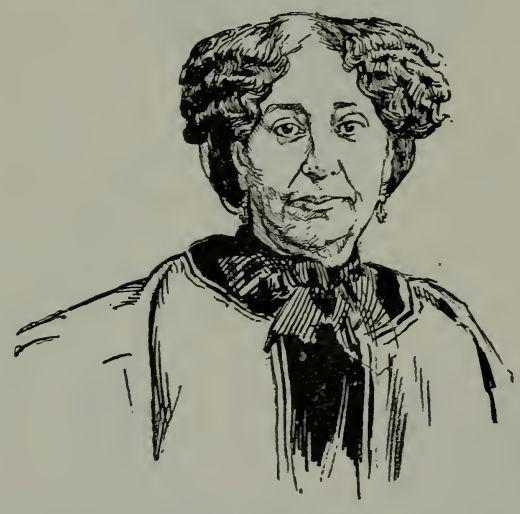
GEORGE SAND In 1870.

Mme. Sand, her hair simply dressed in waving bandeaux, clad in an African gandourah—a sort of blouse